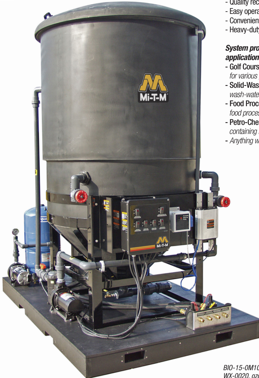
BIO-15-0M10 shown with WX-0020, ozone option