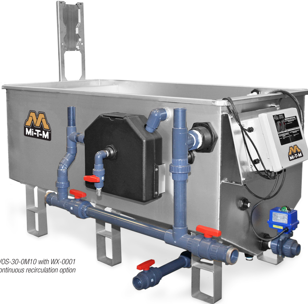
WOS-30-0M10 with WX-0001 continuous recirculation option